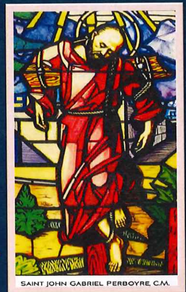
SAINT JOHN GABRIEL PERBOYRE, C.M.

St. Paul, "I live now, not I, but Christ lives in me."